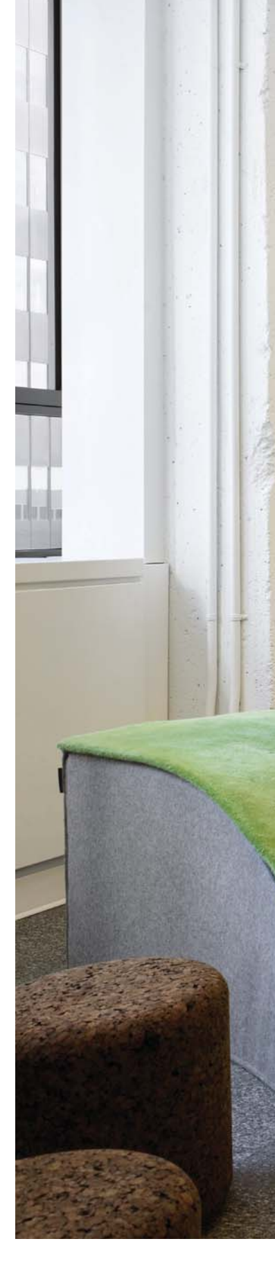
Productive employees don't have to be chained to desks anymore.