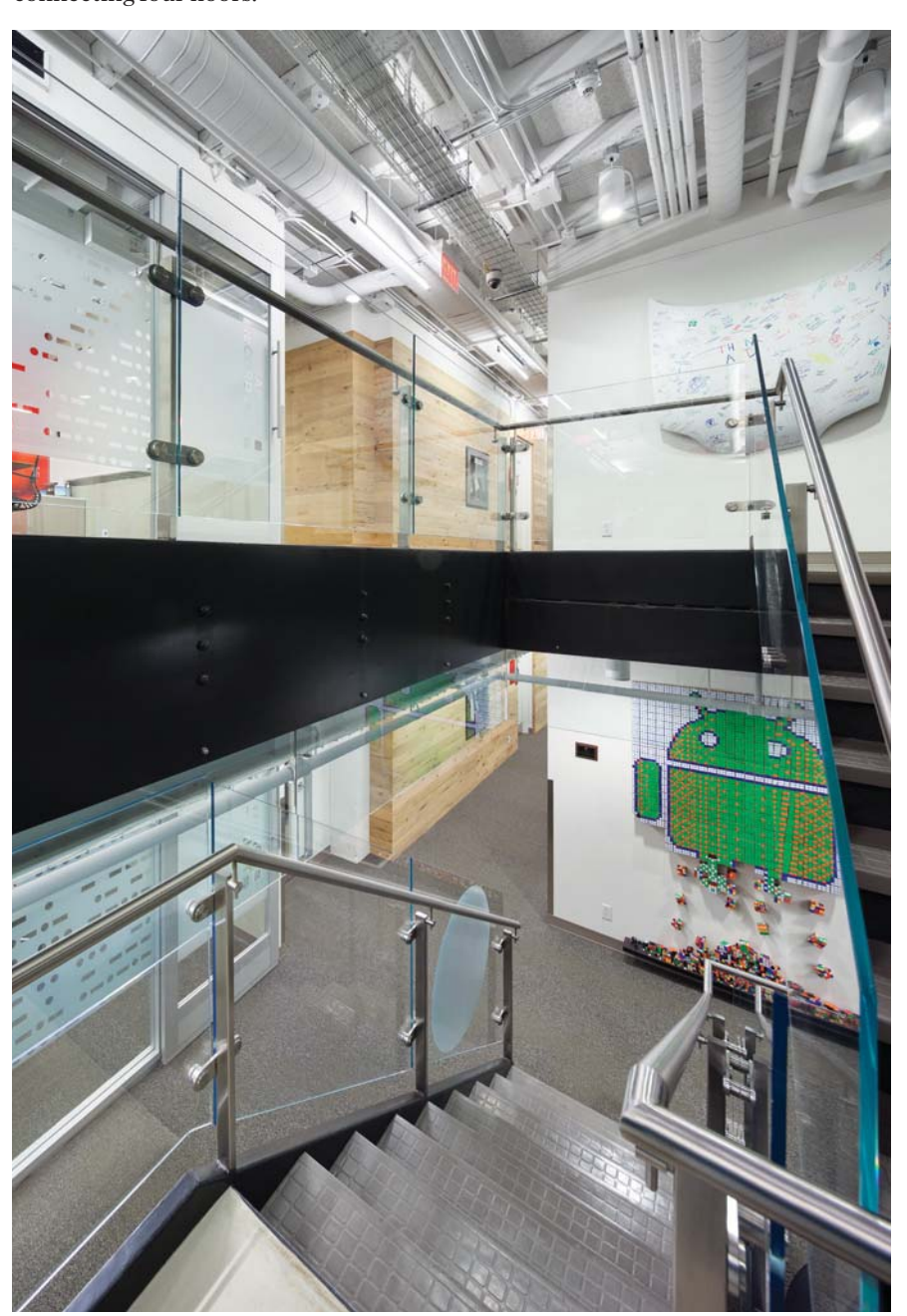
Why wait for an elevator? Open staircases invite people to walk instead.

"We worked really hard to incorporate interior staircases so that people don't have to use elevators to move between floors," says Janus. The open staircase at Google's Toronto office lets people walk between six floors while they enjoy an expansive wall mural depicting travel throughout Canada. GoodLife Fitness also redesigned its office space to include open interior staircases connecting four floors.